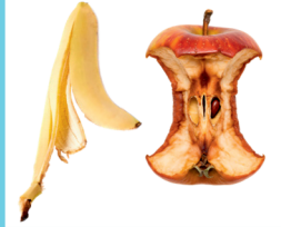
Veg and fruit peelings and cores