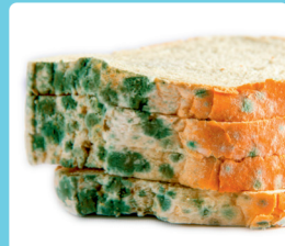
Out of date / mouldy food