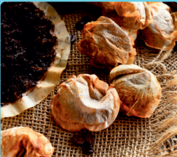
Coffee grounds and tea bags