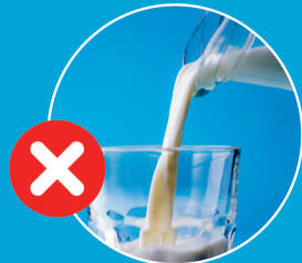
No milk and other liquids