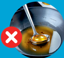
No oils and liquid fats