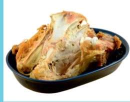
Meat, fish & bones; cooked or uncooked