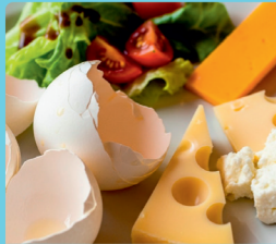
Egg shells. cheese and salad