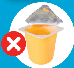
No packaging of any kind

ONLY food waste and caddy liners must go in the caddies. If you include other things, we may not be able to empty it.