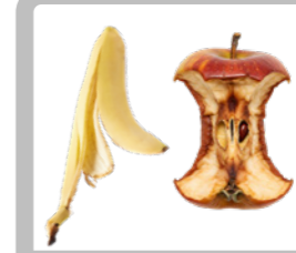
Fruit and veg; peelings and cores