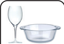
Glassware and Pyrex

For other items not listed, please check the FAQ booklet or visit suffolkrecycling.org.uk