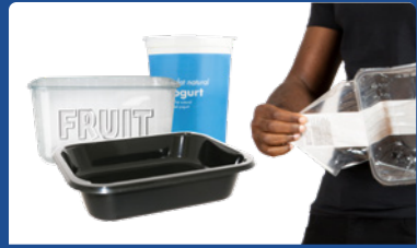
Plastic pots, tubs, food trays and thin cover film