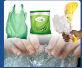
Plastic bags, film and wrapping