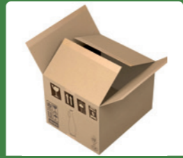
Cardboard boxes (please flatten first)