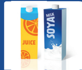
Drinks cartons (Tetra Pak)