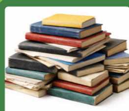
Books - hardback and softback

You can leave the transparent windows in envelopes attached.