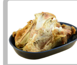
Meat, fish & bones; cooked or uncooked