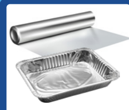
Tin foil and foil food trays