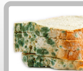
Out of date / mouldy food