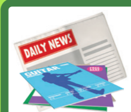
Newspapers and magazines