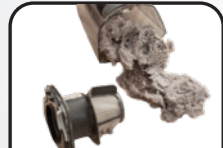
Vacuum dust and sweepings