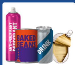
Metal cans and empty aerosols