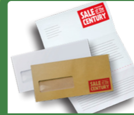
Letters, envelopes and other paper