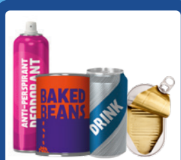
Metal cans and empty aerosols