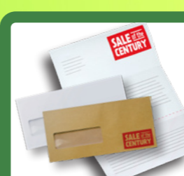
Letters, envelopes and other paper