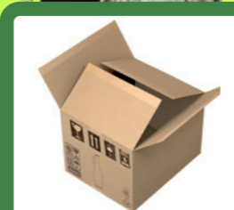
Cardboard boxes (please flatten first)