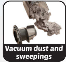
Vacuum dust and sweepings