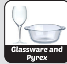
Glassware and Pyrex