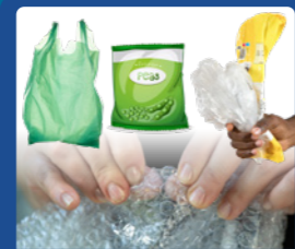
Plastic bags, film and wrapping