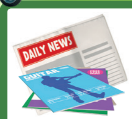
Newspapers and magazines