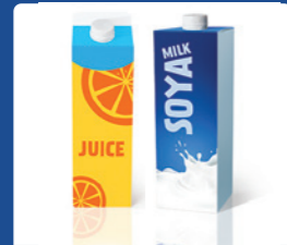
Drinks cartons (Tetra Pak)