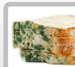
Out of date / mouldy food