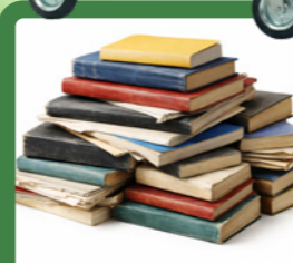
Books - hardback and softback