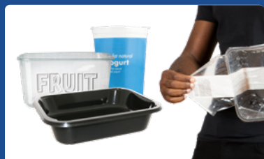
Plastic pots, tubs, food trays and thin cover film