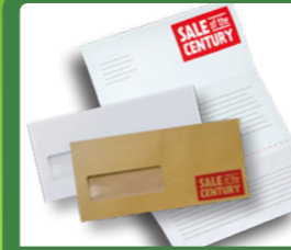
Letters, envelopes and other paper