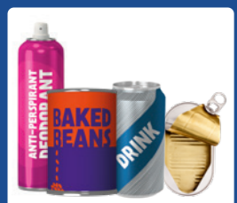
Metal cans and empty aerosols