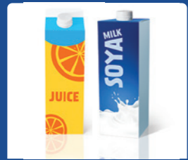
Drinks cartons (Tetra Pak)