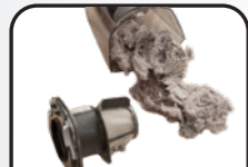
Vacuum dust and sweepings