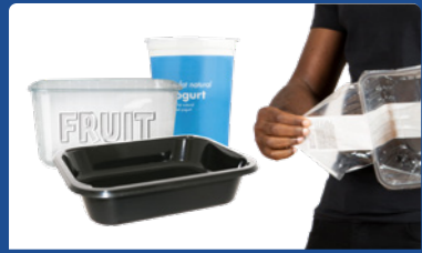
Plastic pots, tubs, food trays and thin cover film